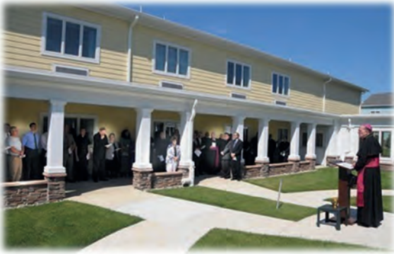
Villa Vianney, Lawrenceville, New Jersey

Your appeal gift helps ensure there will be priests and deacons who strive to embody God’s mercy in all they do, to sustain and nurture the sacramental life of our parishes. Currently 12 seminarians, 213 priests and 63 religious priests and about 282 deacons are supported through the appeal. 69 men receive assistance in their retirement. In 2021, we have 20 Brothers, 24 Priests and 48 women religious ministering in the diocese. Your gift promotes those called to serve.