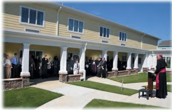
Villa Vianney, Lawrenceville, New Jersey

Your appeal gift helps ensure there will be priests and deacons who strive to embody God’s mercy in all they do, to sustain and nurture the sacramental life of our parishes. Currently 12 seminarians, 213 priests and 63 religious priests and about 282 deacons are supported through the appeal. 69 men receive assistance in their retirement. In 2021, we have 20 Brothers, 24 Priests and 48 women religious ministering in the diocese. Your gift promotes those called to serve.