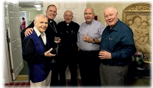
Retired Priests Who Served Generously