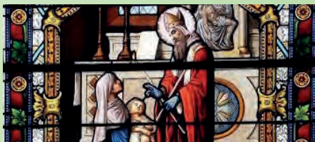
St. Blaise Bishop and Martyr February 3, 2020

The Blessing of Throats will take place at St. Catherine of Siena Chapel at the conclusion of the 9:00AM, Mass on Monday, February 3 rd , the Feast Day of St. Blaise.