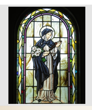
PARISH INFORMATION PASTOR