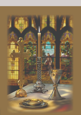
The eyes of all look hopefully to you, and you give them their food in due season. – Pedra 18541

First Reading -- When they had eaten, there was some left over, as the LORD had said (2 Kings 4:42-44).