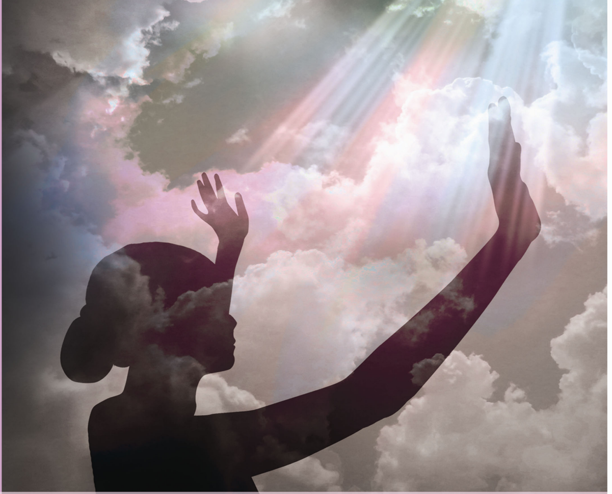
Copyright © J. S. Paluch Co. Inc. • Photos: © gracel21/Fotolia, © merydolla/Fotolia, © DavidMSchrader/Fotolia